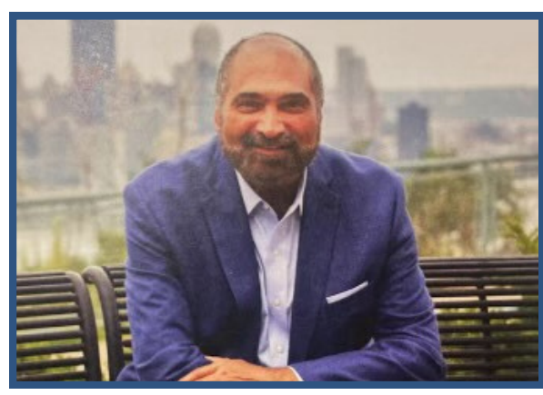
FRANCO HARRIS Super Bakery