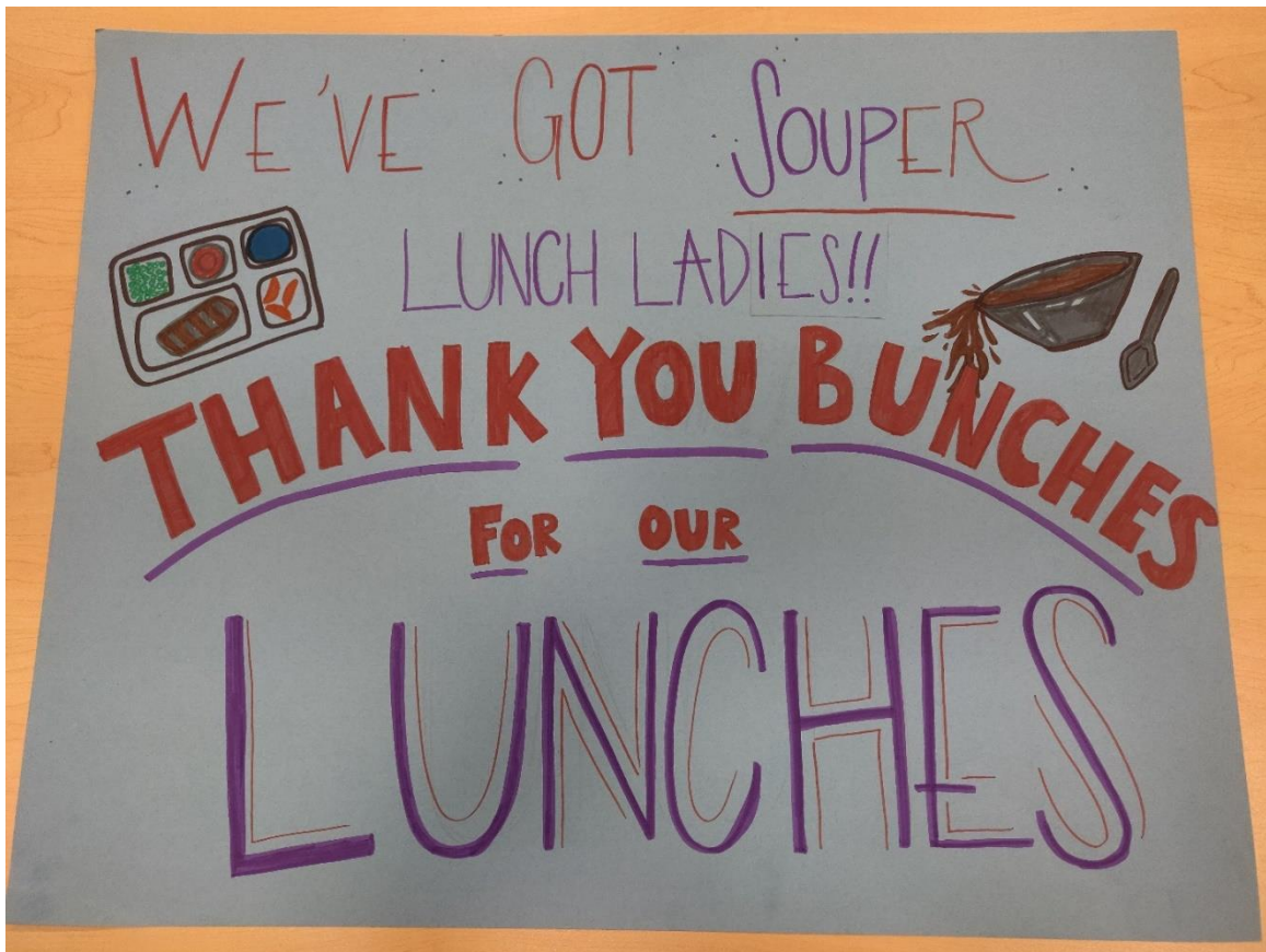
One of the many thank you notes from our students