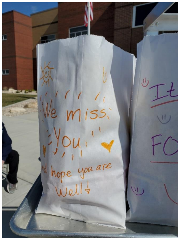
They were missed for sure!