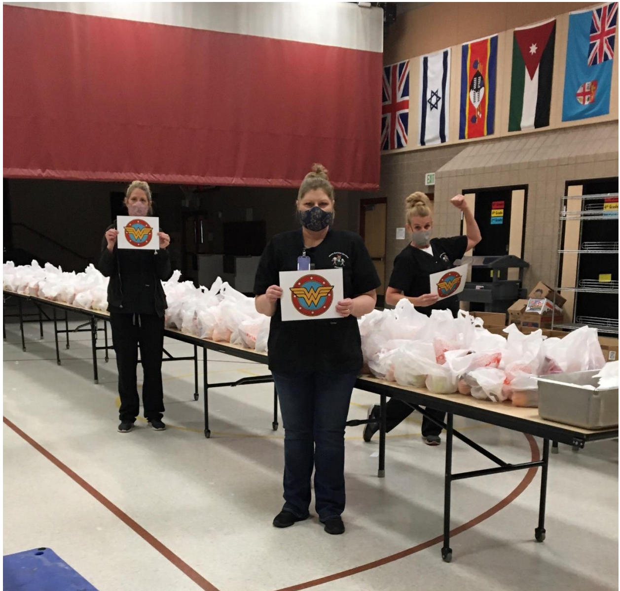
Some of our very own Super Heroes on Super Hero Lunch Lady Day.