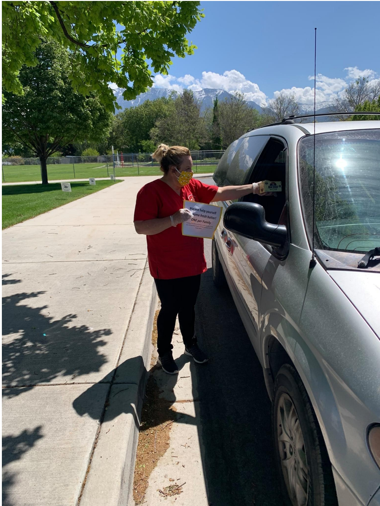
Handing out free butter and cheese from Dairy West Farmers of Utah and Idaho.