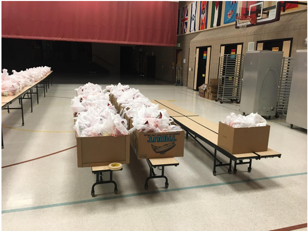
Bagged and ready to go!