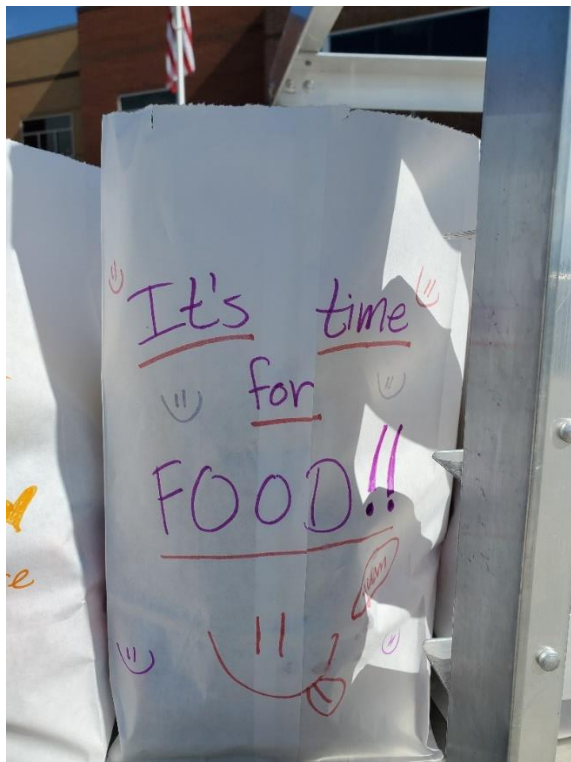
Returning notes to our students