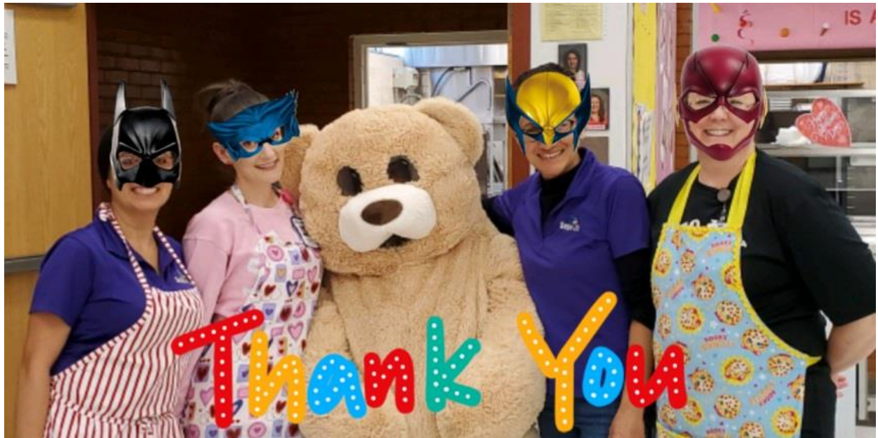
Some of our Super Hero Lunch Ladies.