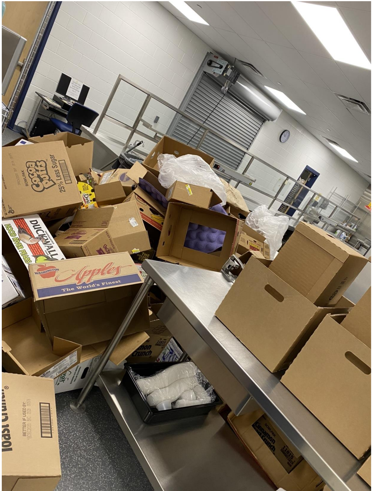
Piles and piles of boxes after loading all of those T-shirt bags full of food.