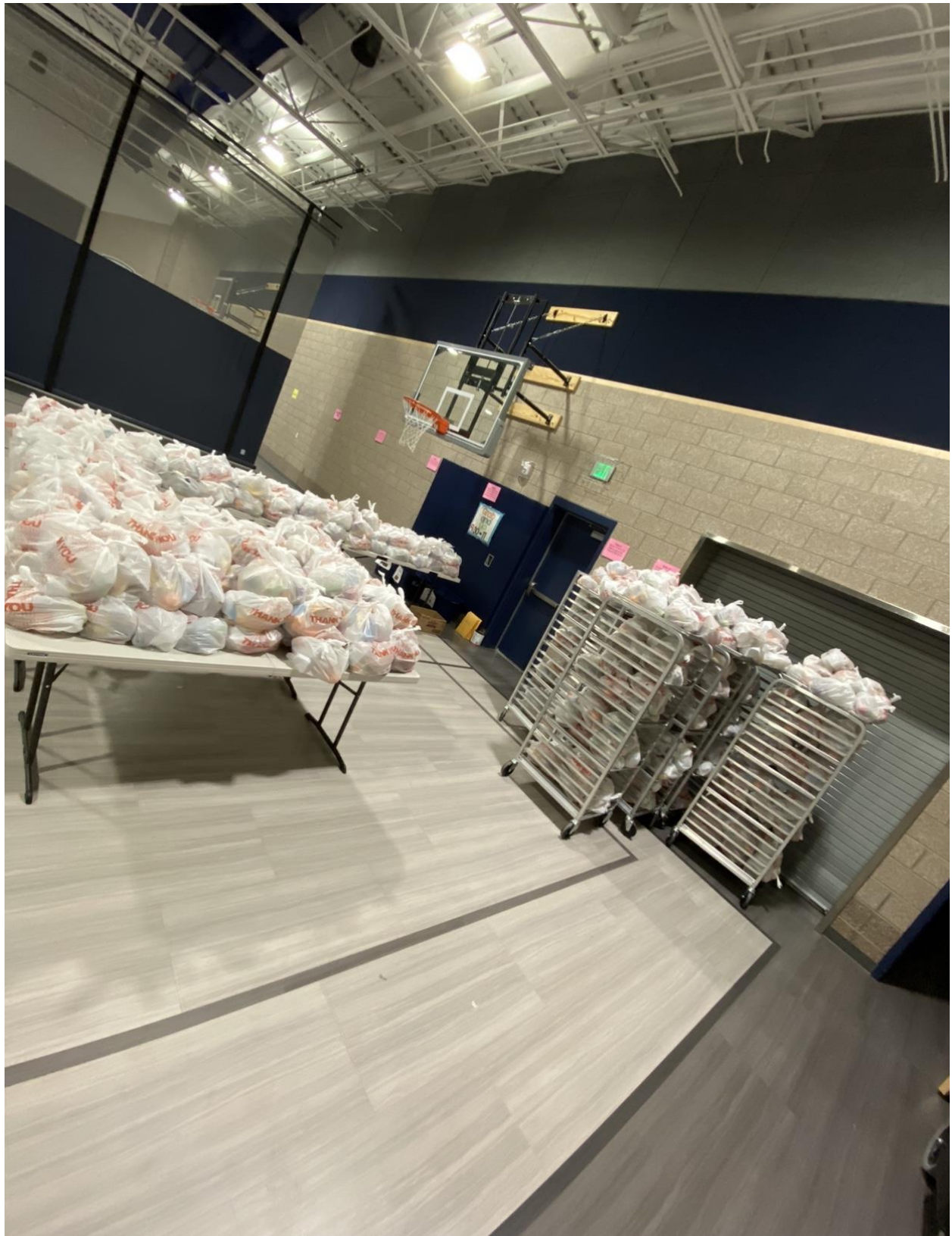
T-shirt bags loaded and ready to hand out at one of our schools.