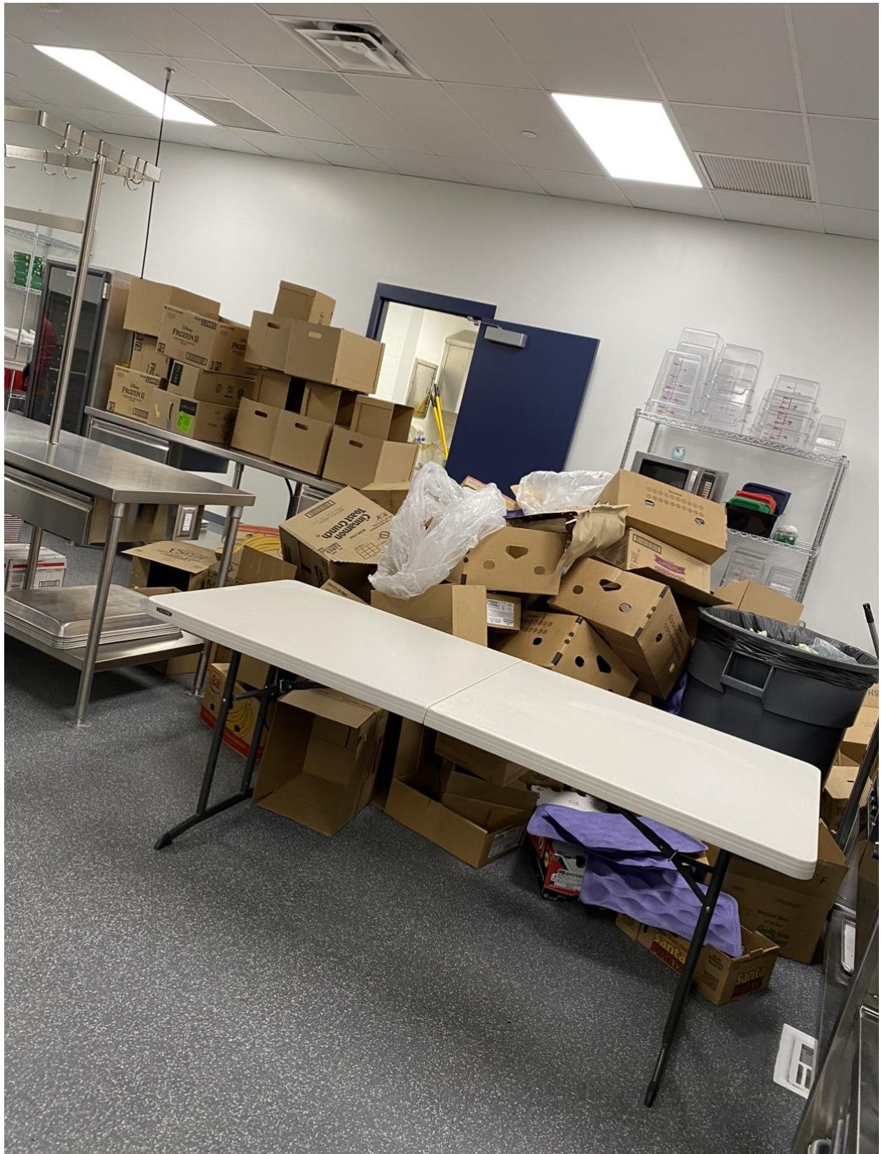
The piles keep growing.