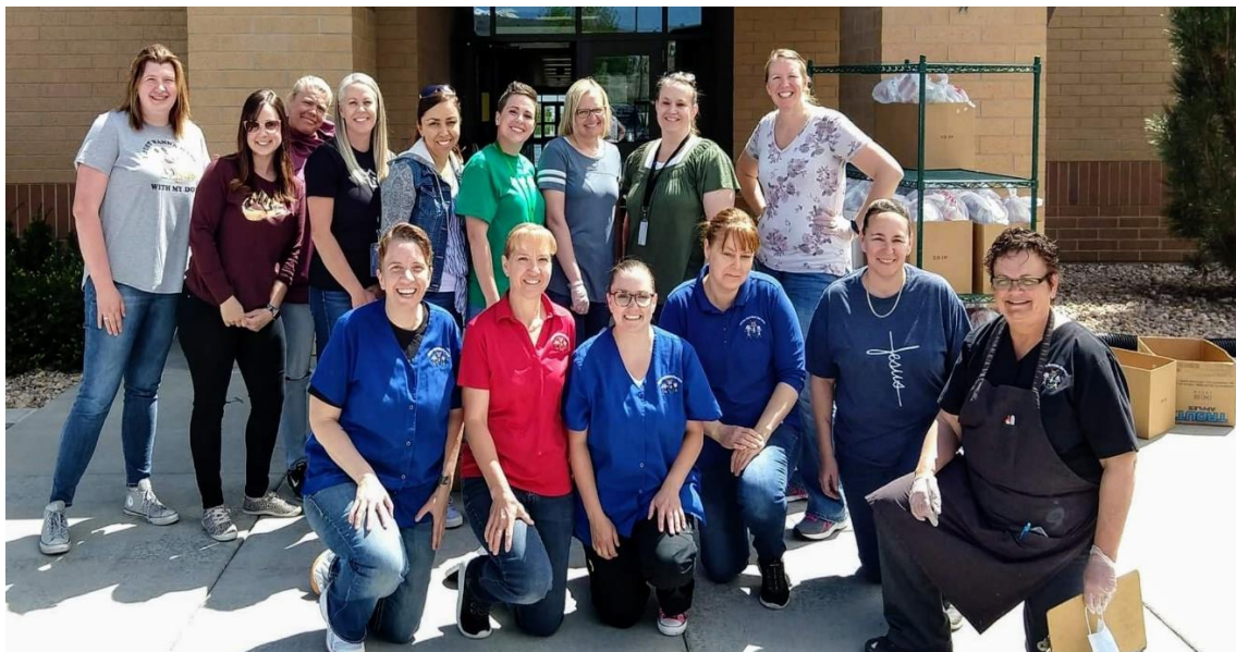
Serving up a lot of lunches with a lot of beautiful smiles