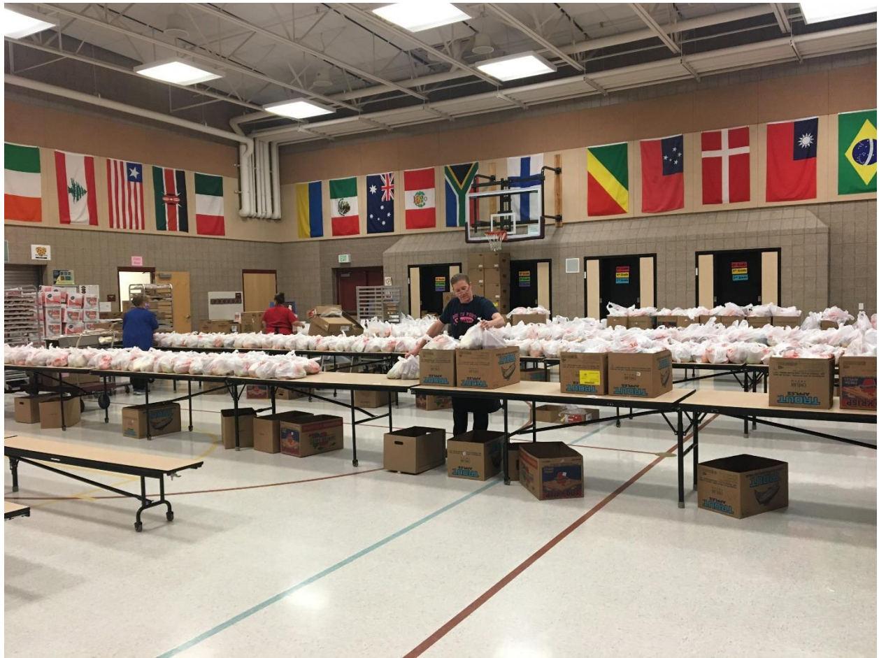
Checking and double checking.