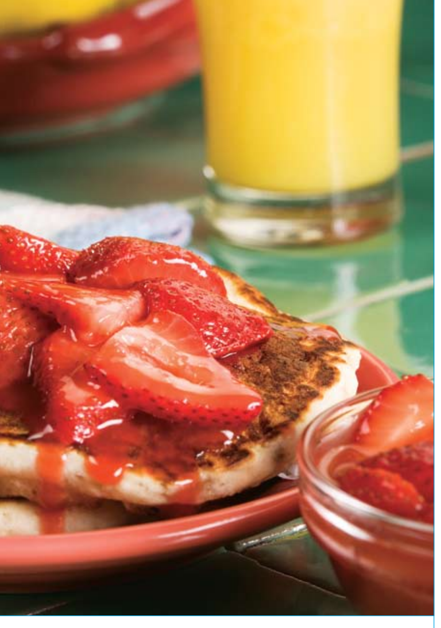
Nutrition information per serving: Calories 109, Carbohydrate 24 g, Dietary Fiber 2 g, Protein 2 g, Total Fat 1 g, Saturated Fat 0 g, Trans Fat 0 g, Cholesterol 3 mg, Sodium 182 mg