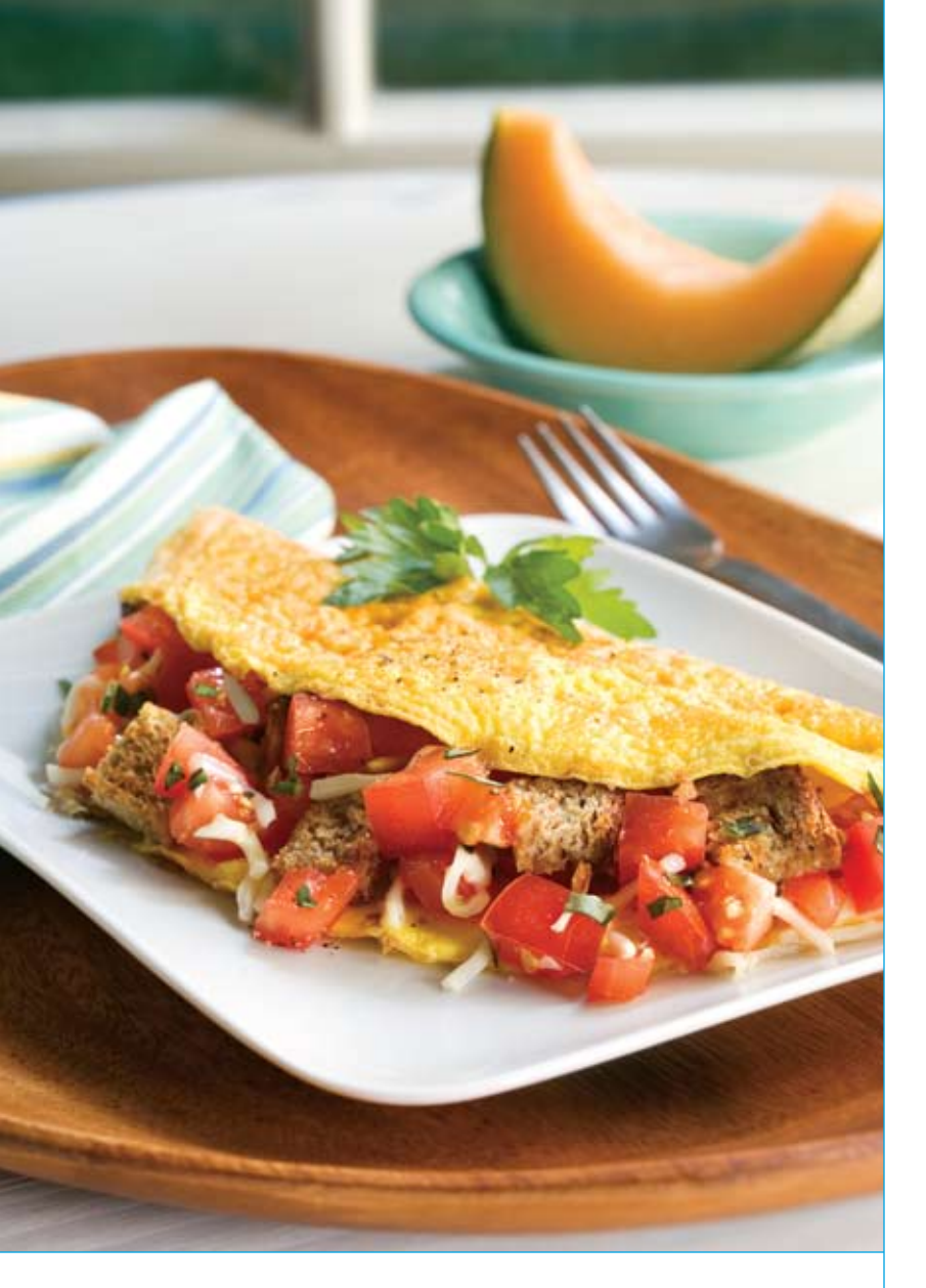
Nutrition information per serving: Calories 235, Carbohydrate 18 g, Dietary Fiber 5 g, Protein 27 g, Total Fat 7 g, Saturated Fat 2 g, Trans Fat 0 g, Cholesterol 8 mg, Sodium 506 mg