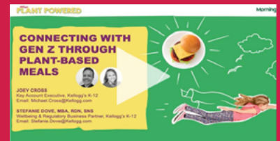
Connecting with Gen Z through Plant-Based Meals