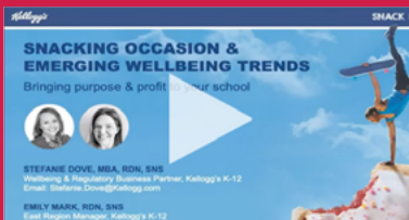
Snacking Occasion & Emerging Wellbeing Trends