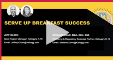
Serve Up Breakfast Success

Earn up to 3 CEU Credits by watching our educational videos: Upon completion of these educational session(s) you can request a certificate of participation by emailing us at: kelloggk12@Kellogg.com. In the email please identify which session(s) you completed. Your certification of participation will be emailed within 10 business days. *Educational Sessions will play on the YouTube platform.