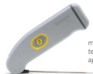
mobile temperature application

Contact: Michele Rogers mrogers@titank12.com 314.422.1100